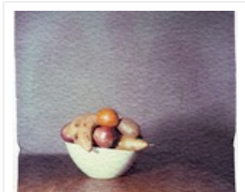
Original polaroid t... pocketmemories $35.00

Etsy: Your place to buy & sell all things handmade Leahmh.etsy.com