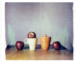
Original polaroid t... pocketmemories $35.00