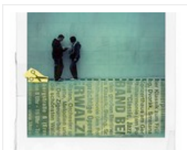
4x5 Polaroid fine a... pocketmemories $9.00